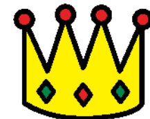
Prom King and Queen

It can be fun to dress up and go out with friends.