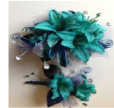
corsage and boutonniere

There are usually a lot of pictures taken before and at prom.