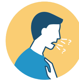
NEW LOSS OF TASTE OR SMELL