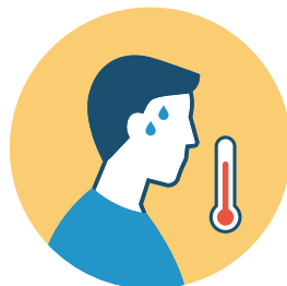
FEVER 100.4* *or school board policy if threshold is lower